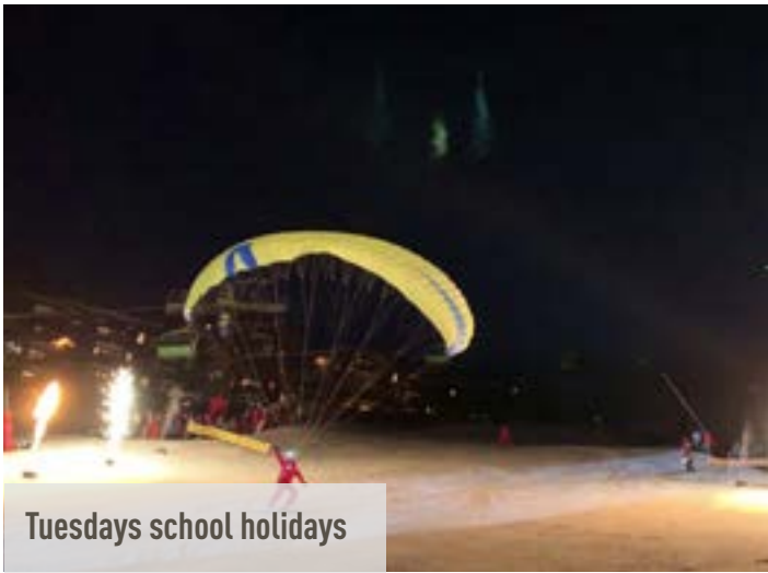
Tuesdays school holidays

The traditional ski shows will take place every Tuesday evening in Valmorel during the French school, with a demonstration of old and current skiing, fireworks and mulled wine! And all this in a sound and light atmosphere at the foot of the Altispace chairlift on the snow front!