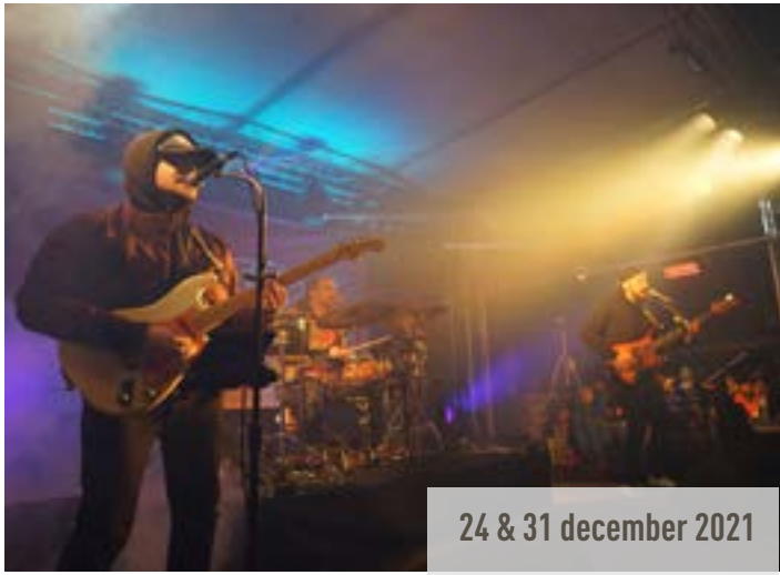
24 & 31 december 2021